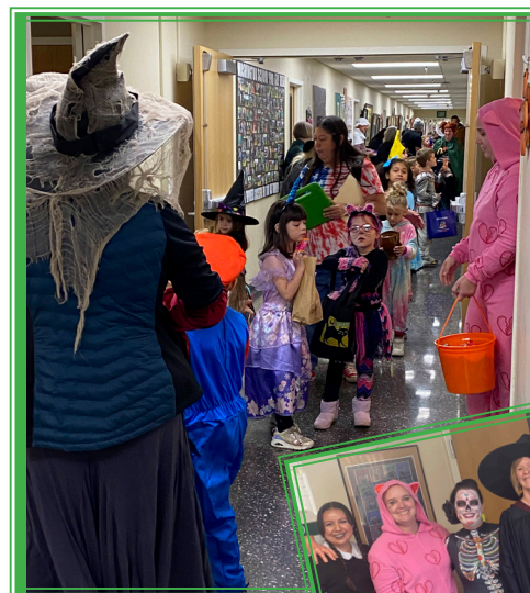
Elementary Halloween Parade