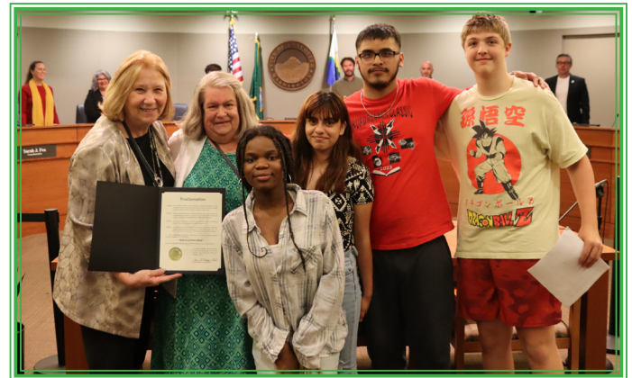
Mayor Anne McEnery-Ogle visits WSD!