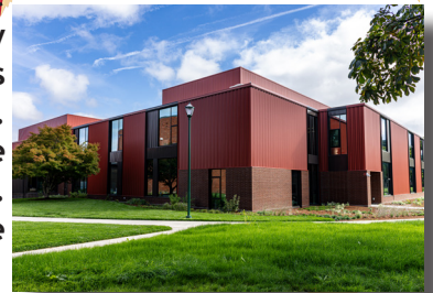
New Divine Academic Building & Hunter Gym