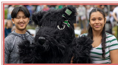
Governor Inslee attending WSD's new Divine Academic Building & Hunter Gym Ribbon Cutting Ceremony!