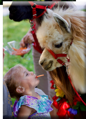
Benny the Llama & Napoleon the Alpaca visit!