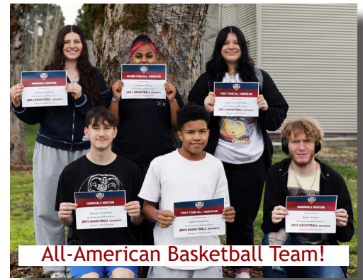
All-American Basketball Team!