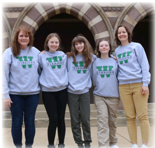
Battle of the Books Team